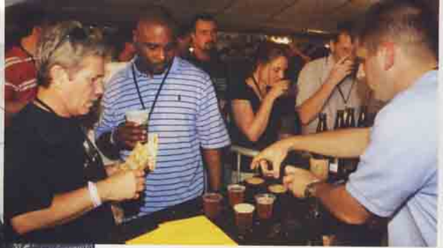
Opposite: Sampling the suds at the Baytowne Wharf Beer Festival. Beers, ales, lagers...it's all good at the Emerald Coast Beer Festival in Pensacola (left) and Lafayette's GulfBrew (above).